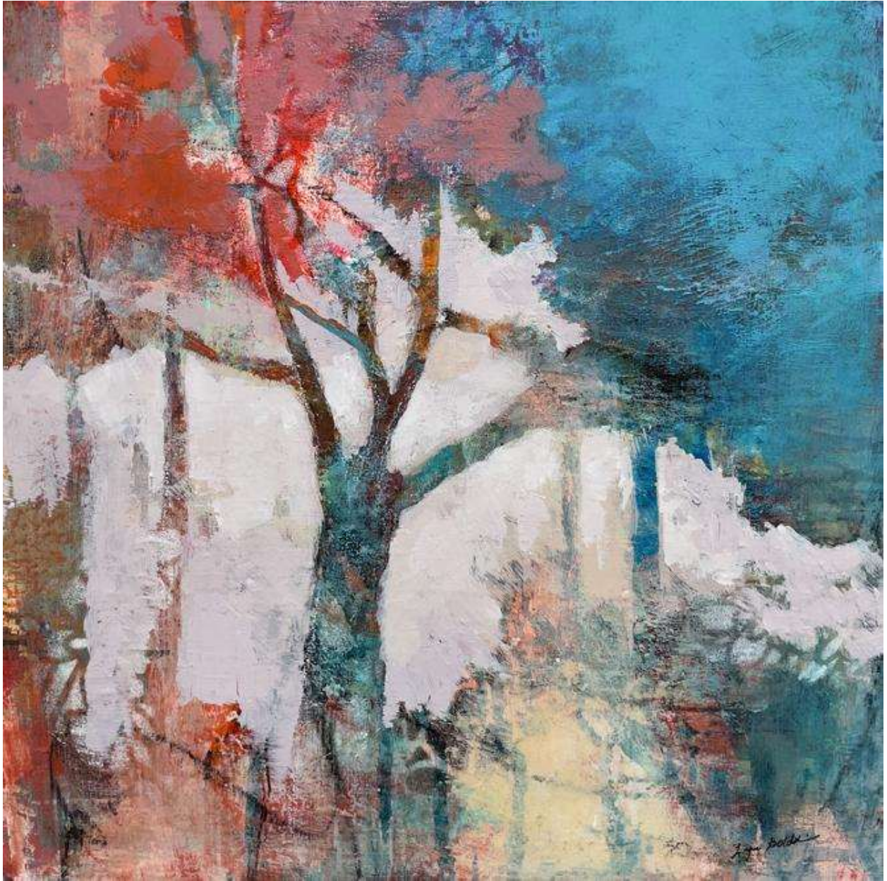
"I Walk Enchanted," 12"x12," acrylic on wood, ©Lynn Goldstein